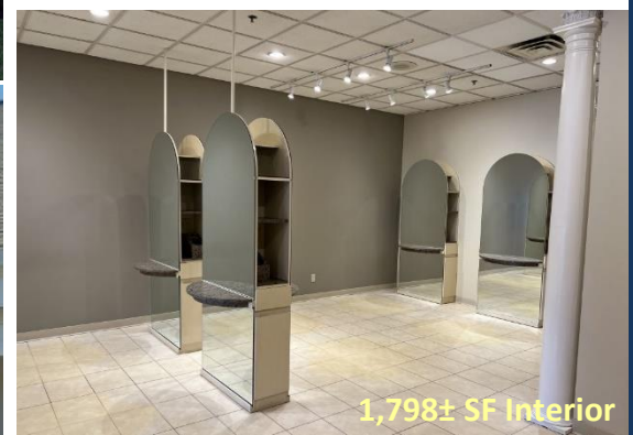
1,798± SF Interior