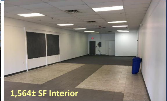
1,564± SF Interior