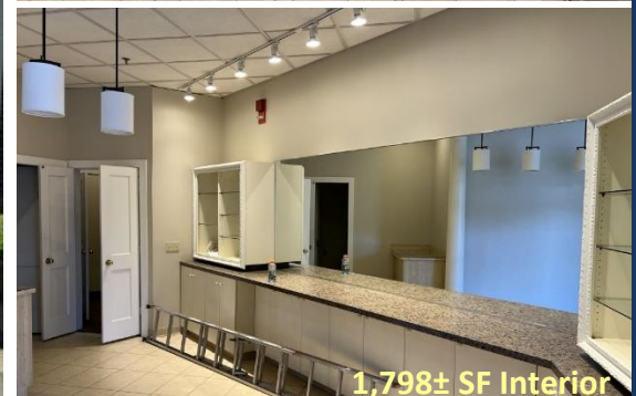
1,798± SF Interior