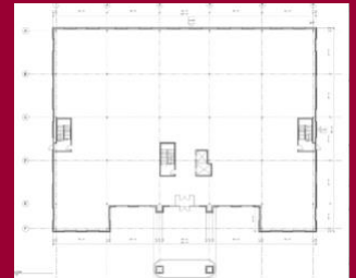
1 st Floor Plan