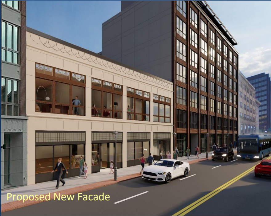
Proposed New Facade

Ranked in Top 50 Commercial Firms in U.S.